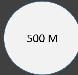
US specialty jewelry (Generates over 43% of sales)